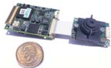
Perceptor DG digital gimbal