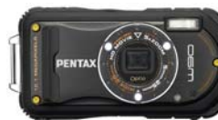
Pentax Optio 12mp