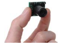
480 line CCD EO & low light option