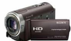
Sony HD 1080p