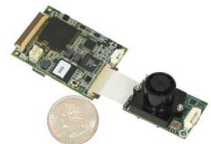
OnPoint VPU™ 1.9" x 1.35" 11 grams (.4oz) 2.1 watts