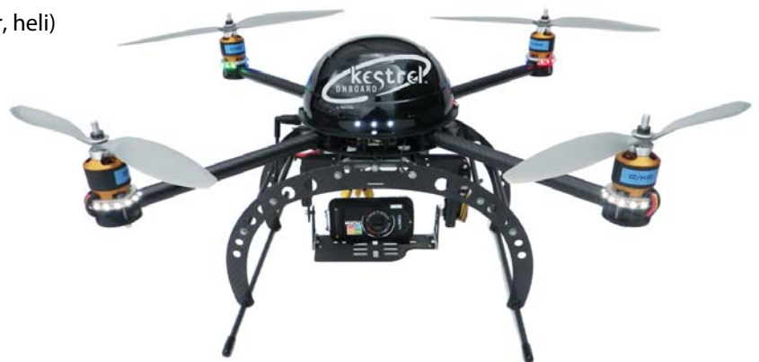
VTOL: Quad, Hex, Octo, Heli